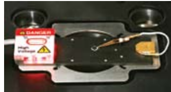
The Piezo Force Module (left) consists of the HVA220 High Voltage Amplifier (top left), the HV sample holder (middle left) and the cantilever holder (above).