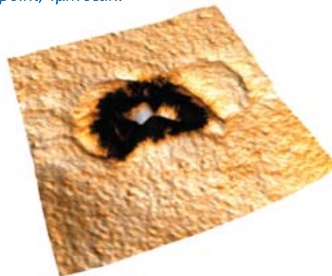
Zoom of the top surface of a red blood cell. The surface shape was rendered to show the topography while the phase channel is painted on top to show piezo response. A small (sub-micron) region on top (brown) of the cell exhibited a much different piezo response than the surrounding cell surface. 2μm scan.

These modes avoid the limitations of conventional sinusoidal cantilever excitation while using resonance enhancement to provide new information on local response and energy dissipation which cannot be obtained by standard AFM scanning modes. The large frequency range (1kHz - 2MHz) of the MFP-3D allows imaging both at the static condition, and effec-